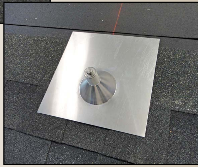
Step 4 & 5 As the roofers work their way up the roof slope, they will install roofing material around the posts and install the appropriate flashing. This is a common practice, and similar waterproof flashing will be installed around vent pipes and skylights.